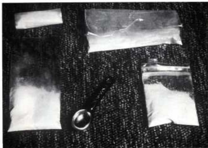
Sample baggies of methamphetamine

This article space sponsored by: John Wiedmann & Sons