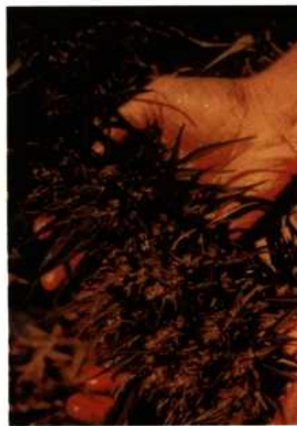
Mature sinsemilla bud

juana smoking and lung cancer is being investigated. Lung damage, such as chronic bronchitis, has been found in heavy smokers of marijuana. There is