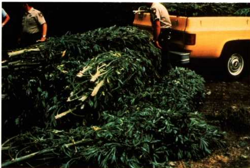
Harvest of marijuana crop

Psychological effects include acute panic or anxiety reaction, lack of motivation, time distortion, paranoia and delusions.”