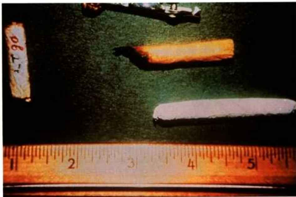
From left to right: roach clip, roach, and an unused joint.